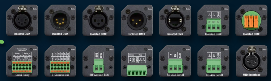
(Smart Modules sold separately)