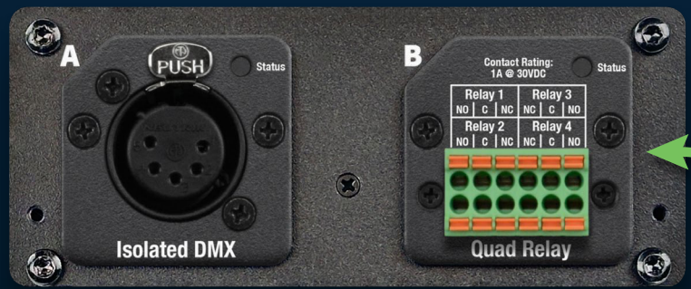
Back Panel of 2-Port SmartNode